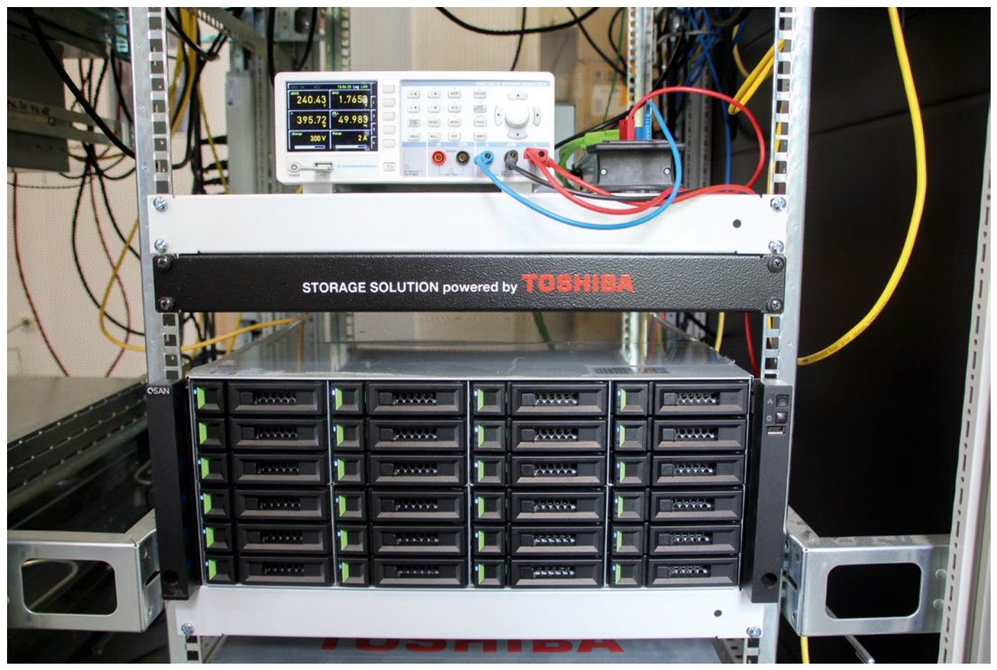
Figure 1: The QSAN XCubeNXT XN5124D in Toshiba's HDD Lab

age (NAS) providing shared folders/file system or as block storage for dedicated storage area networks (SAN) like iSCSI, Fibre Channel, or even both in parallel. QSAN promotes it as "the newest generation of XCubeNXT that harnesses industry-leading versatility for mixed workloads." Additionally, the highly available and secure multiple protocol and cross QSAN platform support is claimed as being the best Total Cost of Ownership (TCO) for capacity demanding applications.